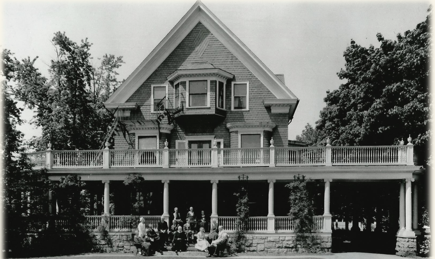
Scandinavian Old People's Home

Ever since our founding as the Scandinavian Old People's Home Association way back in 1930, this organization has provided compassionate, innovative, person-centered care to those we serve, promoting their optimal wellness and quality of life. This is reflected in our vision: